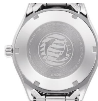
Case back with engravings.